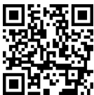
UX10 3D demo